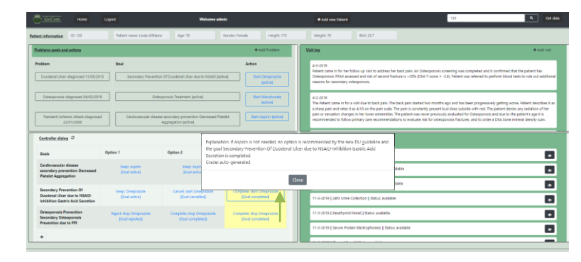
Fig. 2. A screenshot showing an example of the user interface produced by GoCom for a patient with three morbidities. The insert shows an explanation for the goal Inhibition Gastric Acid Secretion for one of the option sets (Option 3).

The user can search for a patient, as well as create a new patient and add a new diagnosis or a visit to the patient record.